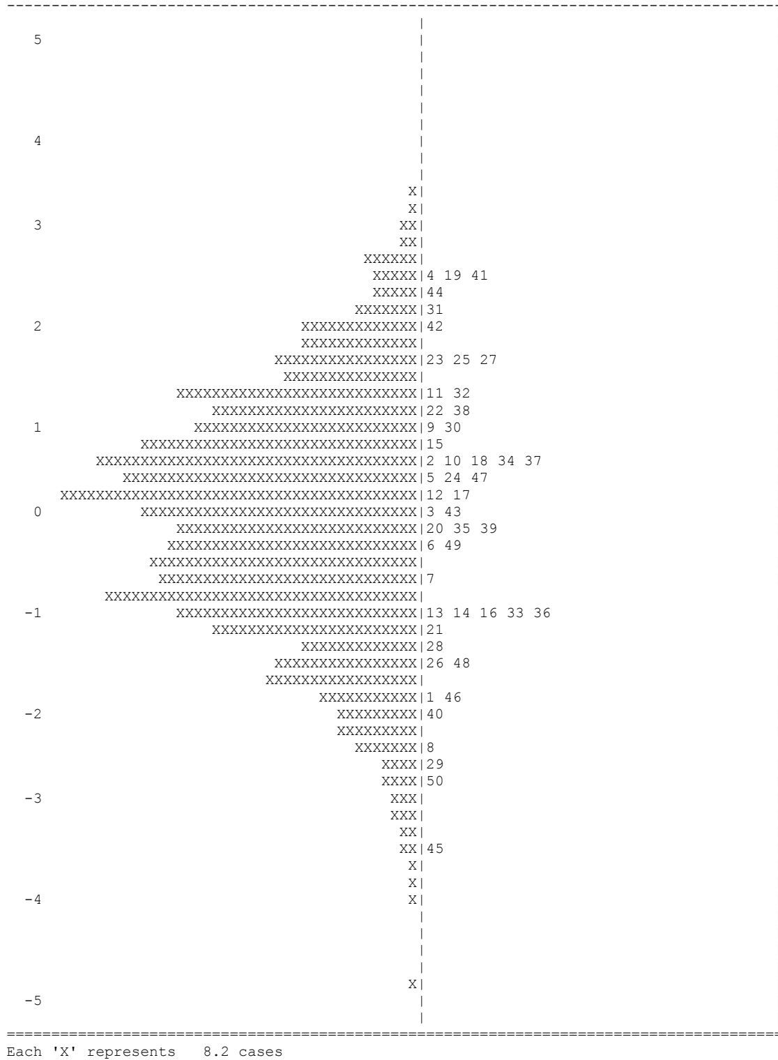
Figure 1. Whole-word level in Grade 5.